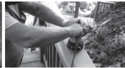
FINISH SANDING #60-#80 GRIT