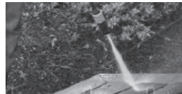
PRESSURE WASHING 3000 PSI